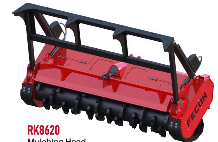
RK8620 Mulching Head