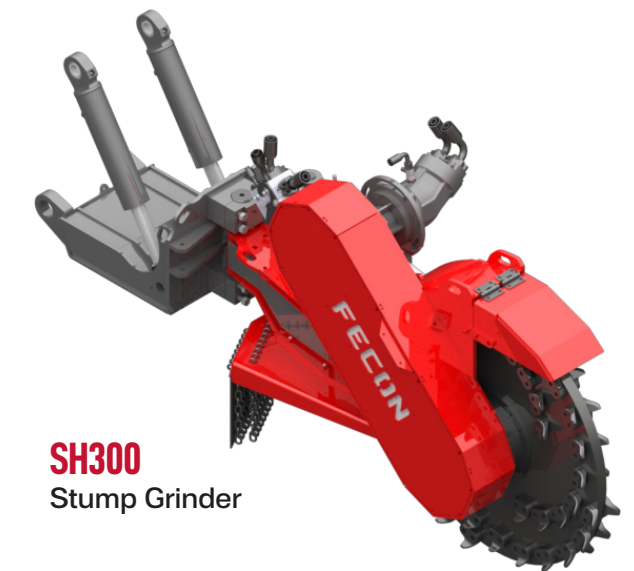
SH300 Stump Grinder