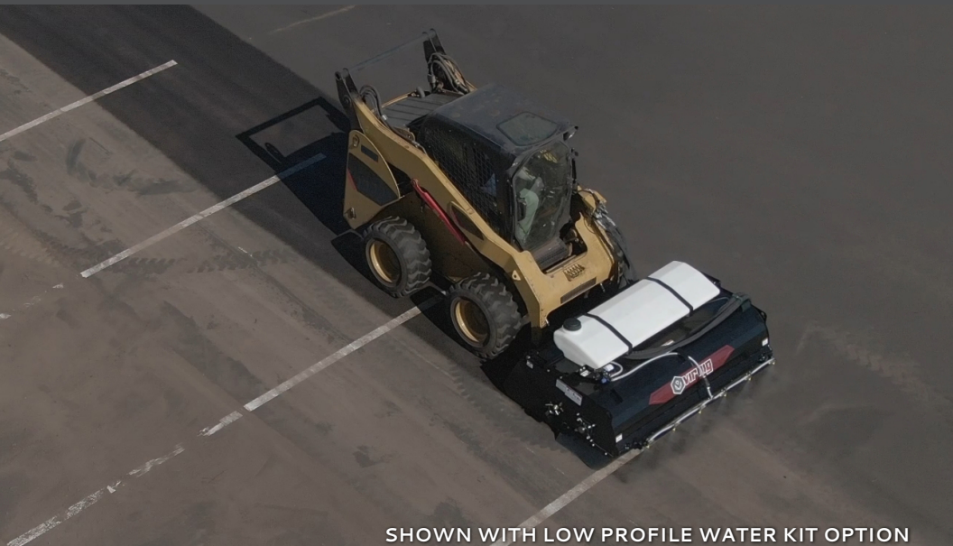
SHOWN WITH LOW PROFILE WATER KIT OPTION