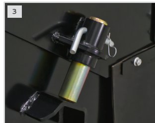
3. PIN ADJUSTMENT SYSTEM TO QUICKLY SET BRISTLE HEIGHT