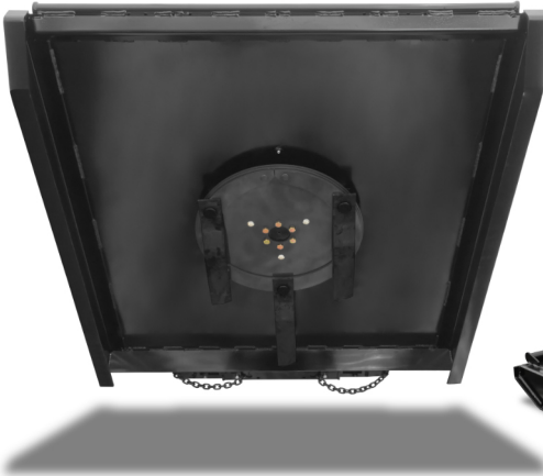
DETAIL UNDER DECK