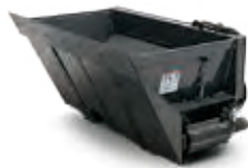
Side Discharge Bucket